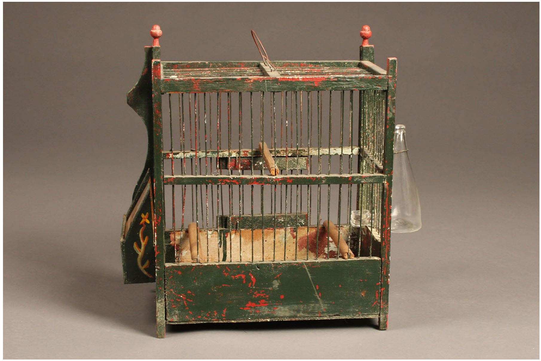
Very nice French finch cage hand painted to resemble a Gypsy's cart or wagon