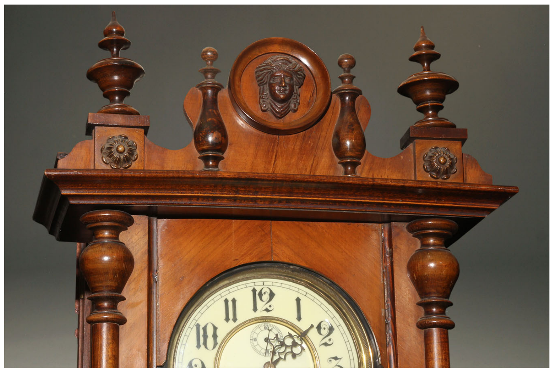
Late 19th century walnut Vienna regulator with 8 day time and strike movement